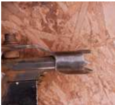
Contact safety tip