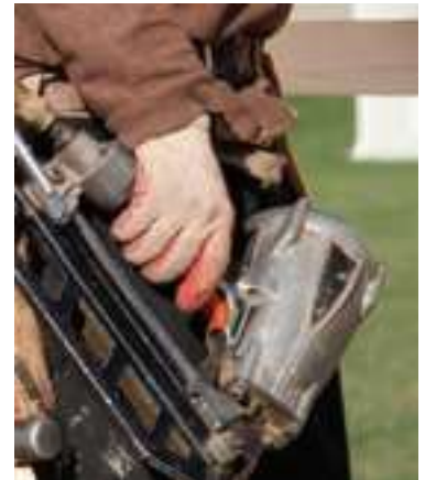
Common nail gun grip with finger on trigger

Bypassing or disabling certain features of either the trigger or safety contact tip is an important risk of injury. For example, removing the spring from the safety contact tip makes an unintended discharge even more likely. Modifying tools can lead to safety problems for anyone who uses the nail gun. Nail gun manufacturers strongly recommend against bypassing safety features, and voluntary standards prohibit modifications or tampering. 7 OSHA's Construction standard at 29 CFR 1926.300(a) requires that all hand and power tools and similar equipment, whether furnished by the employer or the employee shall be maintained in a safe condition.