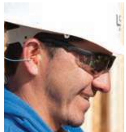
Worker using recommended PPE when working with nail guns: hard hat, safety glasses, and hearing protection