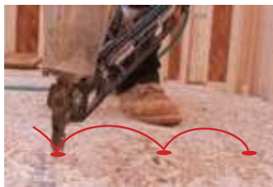
Bump firing or bounce nailing is using a nail gun with a contact trigger held squeezed and bumping or bouncing the tool along the work piece to fire nails. Red dots show path of motion.