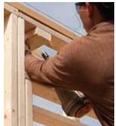
Nail penetration through the lumber is a special concern where the piece is held in place by hand